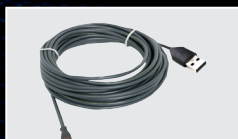
XY USB ADAPTER