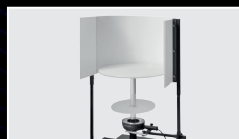
XY OPAL DESK