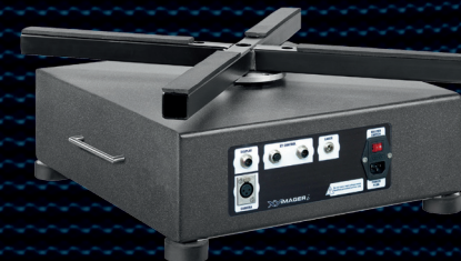
XY SPIN TOP 50 i

Supports weights of up to 50 kg at its center.