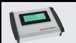
XY DISPLAY ONLY